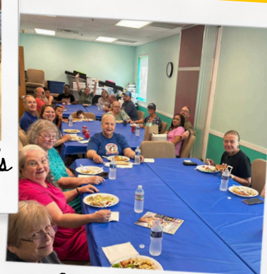
Movie Night Fellowship