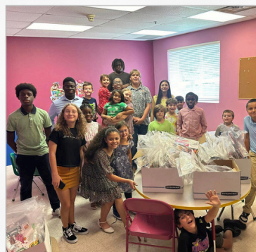
Activity Bags for kids in CPS