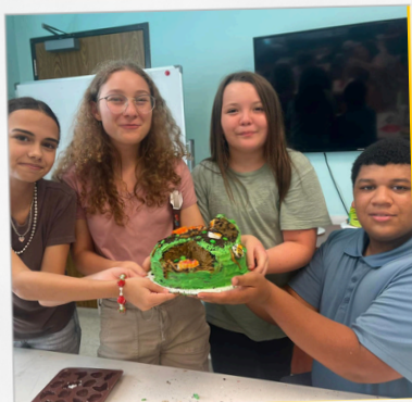
"Nailed It" Winners