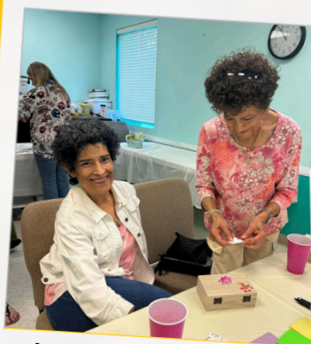
Ladies Craft Event