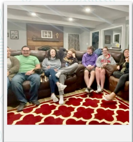
February Young Adult home group!