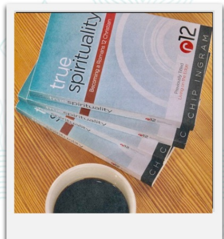
Single Women's bible study series