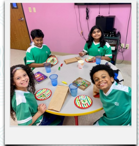
Awana Clubbers decorating cookies

Awana is every Wednesday evening from 7:00-8:30 pm. The children get to have fellowship, learn about God, and play games. They have been learning the importance of hiding God's word inside of our heart. They are learning that in a world of sin and suffering, Jesus is our hope! March 9th is Super Scooper night and on March 16th there will be no Awana because of Spring Break!