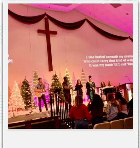
Youth leading worship in the sanctuary!

March 13-15th: A few days spent at Pine Springs Camp Site partnering with several other churches to help with some projects. This is where our teens and kids have been going to summer camp. Food and lodging will be provided by the camp. The only expenses will be travel. We would leave after Sunday morning service on March 13th and return on the 15th. Please let us know if your teens are interested, or you are interested for them.