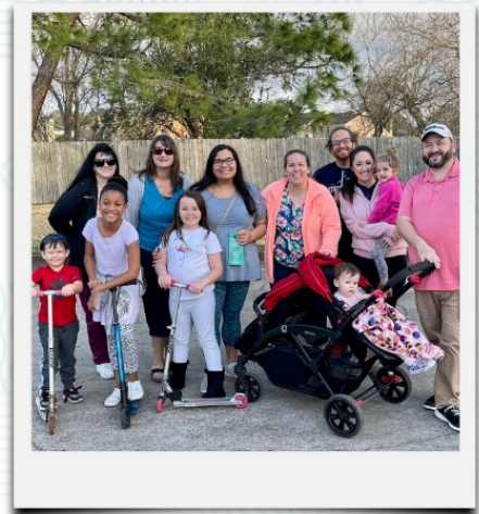
February Pray & Go group